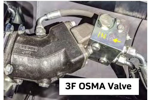
3F OSMA Valve

1.By-pass 2.Anti shock 3. Automatic Oil flow regulation