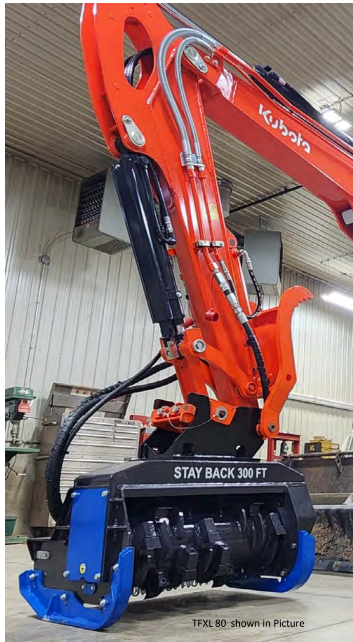
TFXL 80 shown in Picture