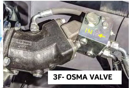
3F- OSMA VALVE

1.By-pass 2.Anti shock 3. Automatic Oil flow regulation