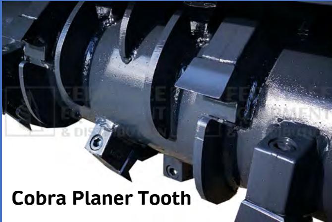
Cobra Planer Tooth